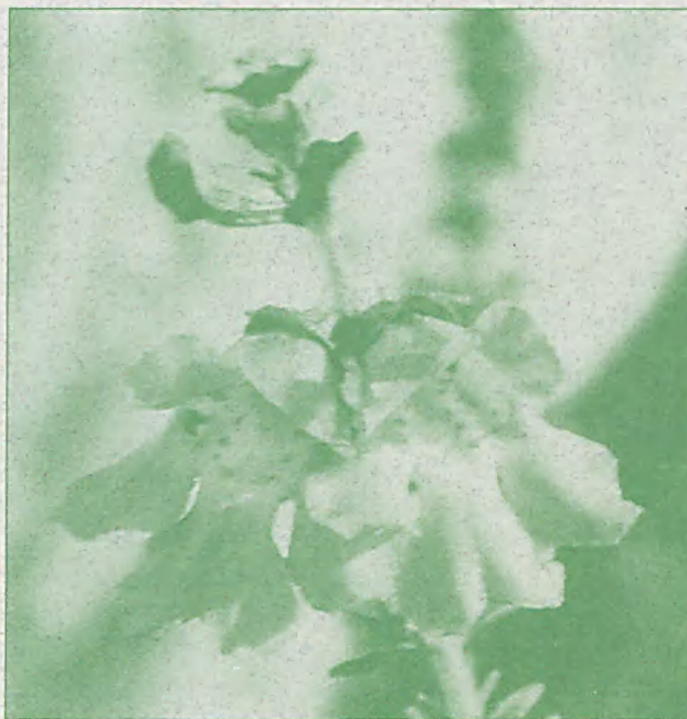
Prostanthera eurybioides flower from a plant on display at Monarto Zoological Park.

There had been a fire through this section a couple of years before we bought the land, so we didn't hold much hope for the rare plant as the previous owner said "a couple of these plants were left". We got busy growing trees and making the usual beginners' mistakes of putting in introduced species (in this case West Australian gums and wattles). As time went on, we started collecting seeds of local species which really saved us in terms of plant survival and interested us in what were the original plants of the area. We constantly searched for the rare plant, and then after three years of owning the place, we took into the Botanic Gardens what we thought was the right specimen. After waiting for sometime in the lobby, out came a very excited guy demanding to know where we had got this specimen and did we know that it was Prostanthera eurybioides . Of course we had been pretty sure it was, but we didn't want to